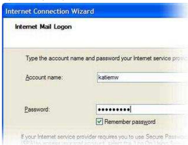
Internet Connection Wizard's Internet Mail Logon

Note: If you're concerned about break-ins to your e-mail, click to clear the check in the Remember Password box. You'll then be prompted for the password each time you send or retrieve mail.